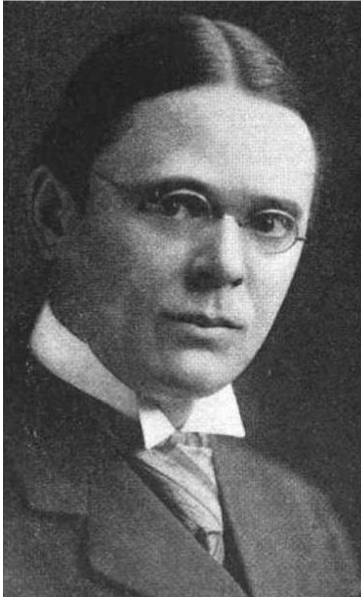
Roscoe Pound (1916)