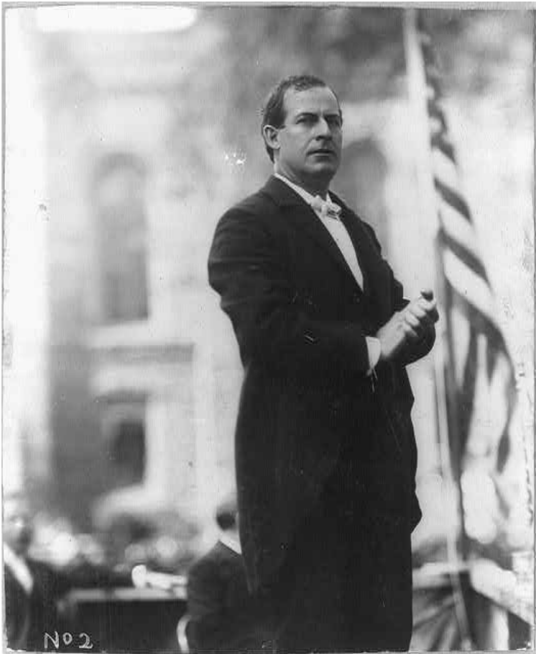
William Jennings Bryan (October 3, 1896)