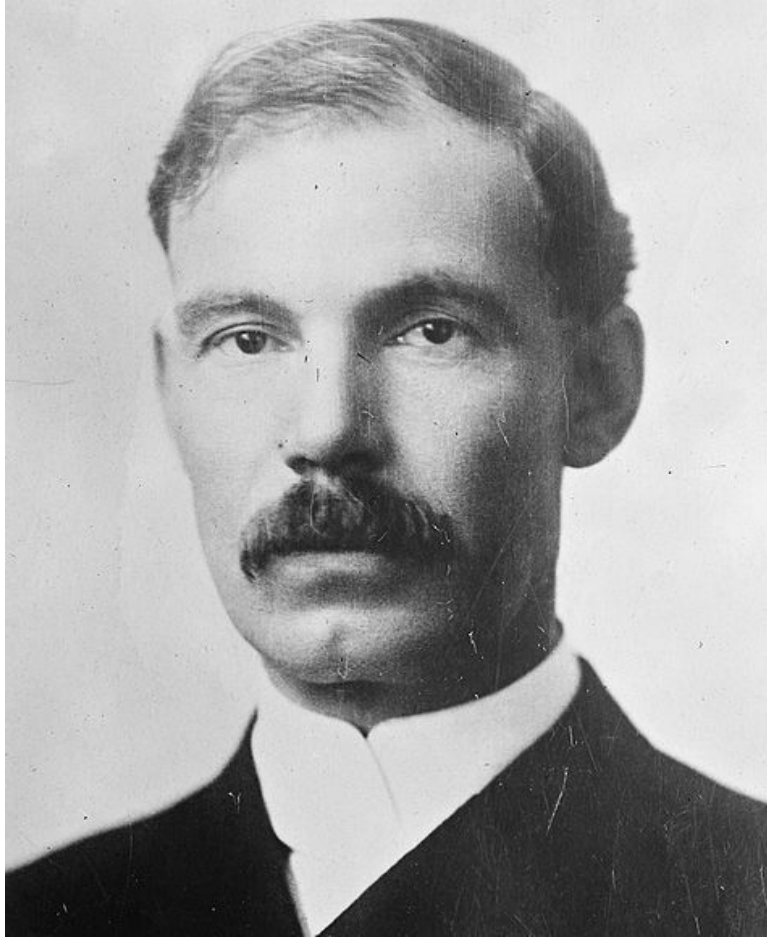
Professor Edward A. Ross